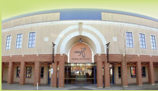
The Michael J. Fox Theatre Burnaby South Secondary School, 5455 Rumble Street, Burnaby, B.C. (Enter off McPherson or Antrim Ave)